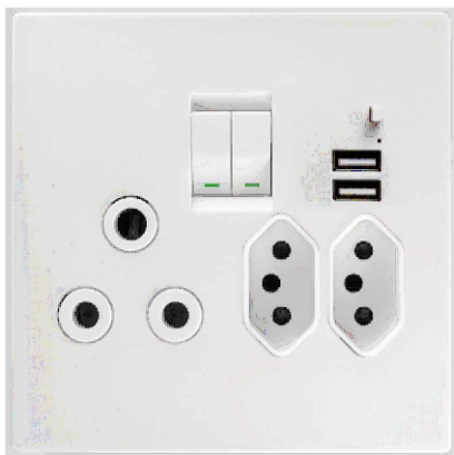
Typical PL1 Plug